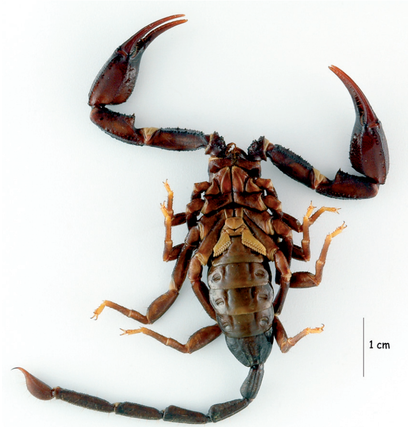
Fig 2. Heteroscorpion kaih sp. n.: female holotype, ventral aspect.

brown with the tip of the fingers reddish yellow. Legs reddish-yellow with tarsi yellowish.