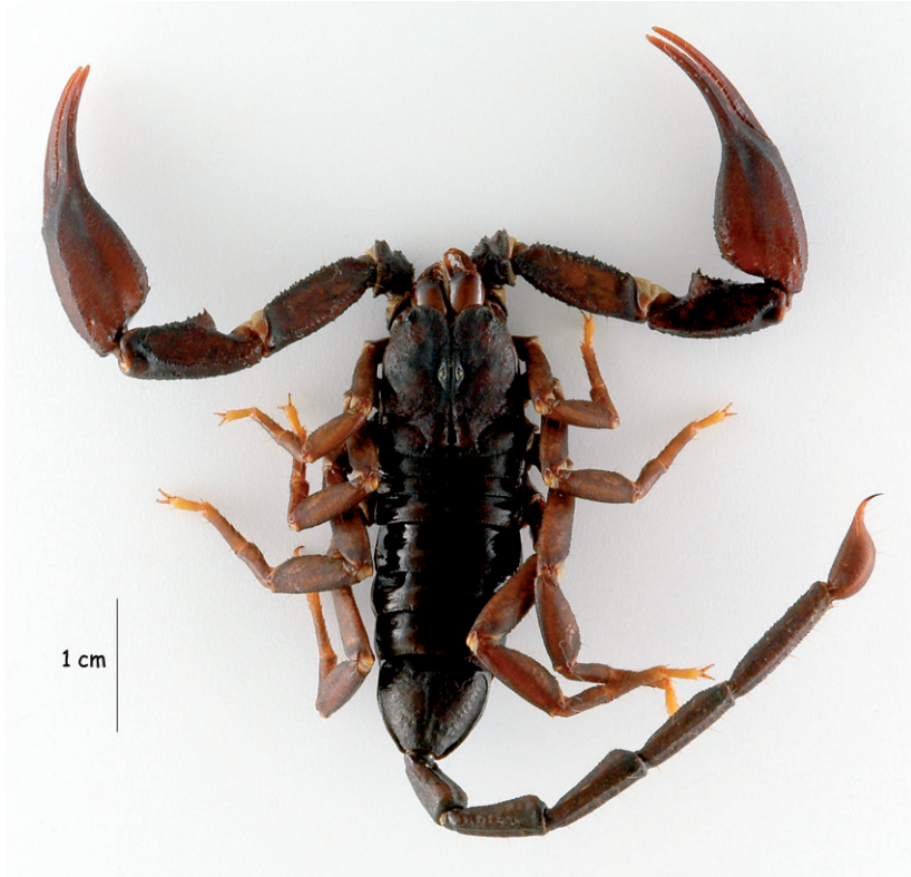
Fig 1. Heteroscorpion kaih sp. n.: female holotype, dorsal aspect.

setation. Trichobothriotaxy of type C, neobothriotaxic majorante (+); patella with 18 external trichobothria, and 10 ventral trichobothria; chela (chela + fixed finger) with 8 ventral trichobothria.