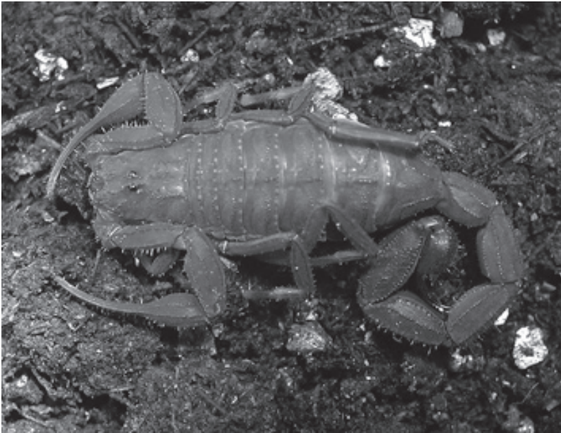
Fig. 11. Tityus ythieri sp. n., paratype ♀ (alive).

MORPHOLOGY. P r o s o m a : Carapace moderately to strongly granular; anterior margin with a moderate concavity. Anterior median superciliary and posterior median carinae moderate. All furrows moderately deep. Median ocular tubercle distinctly anterior to centre of carapace. Eyes separated by a little more than one ocular diameter. Three pairs of lateral eyes. Sternum subtriangular. M e s o s o m a : tergites moderately to strongly granular. Median carina moderate in all tergites. Tergite VII pentacarinata. Venter: genital operculum divided longitudinally; each half with a semi-triangular shape. Pectines: pectinal tooth count 20-20 in female holotype and 21-21 in male paratype; basal middle lamellae of the pectines strongly dilated in the female. Sternites weakly granular with elongate spiracles; VII with four carinae. M e t a s o m a : segment I with 10 carinae, crenulate; segment II with 10