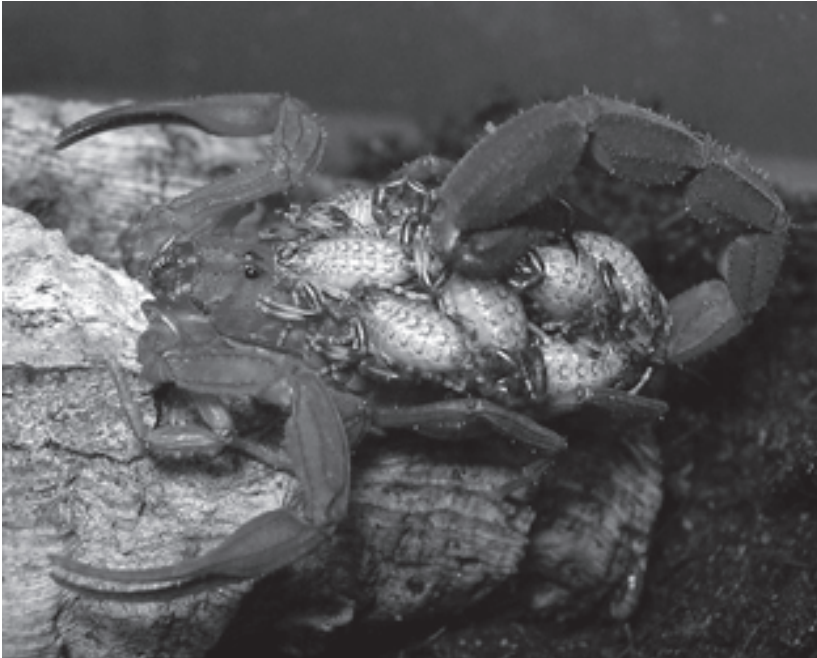
Fig. 12. Tityus ythieri sp. n., female with brood.